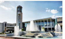
Missouri State University