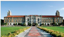
Texas Tech University