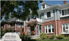
Idaho State University