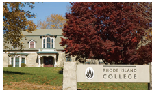
Rhode Island College