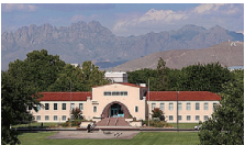
New Mexico State University