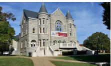
Virginia Union University