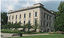
Indiana State University